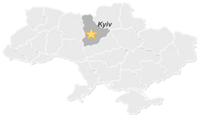
Map of Ukraine